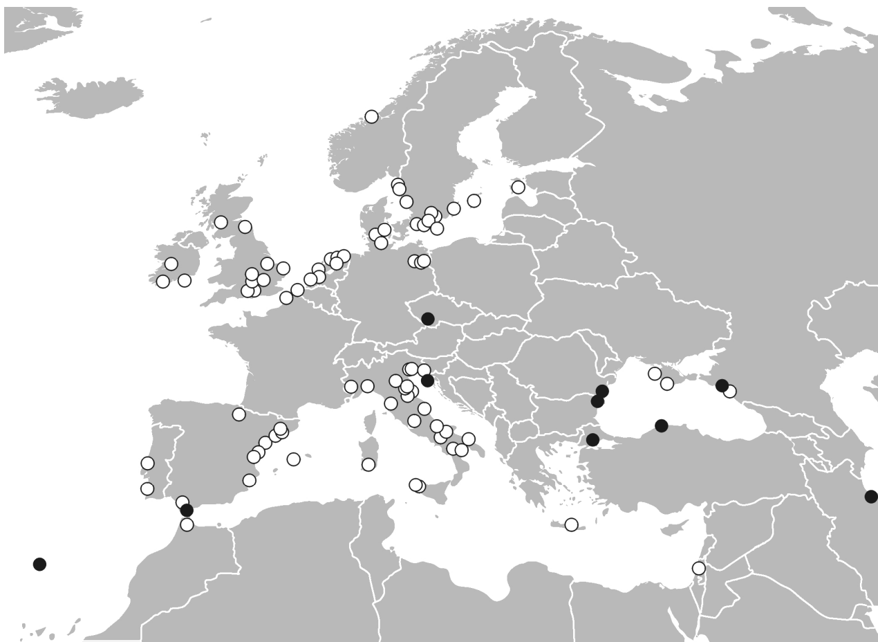
Fig. 1. The distribution of Caloplaca ulcerosa in Europe, northern Africa and the Near East. White dots, literature data; black dots, new data.

In North America, C. ulcerosa is only known from the inland, in contrast to Europe. Nevertheless, ITS sequence of the North American C. ulcerosa obtained by Ulf Arup (Ulf Arup1017, Kansas) is somewhat similar to sequences of European specimens, but it represents another species. One unidentified specimen from the Austrian Alps (Austria, Carinthia, Gailtaler Alpen, on Sambucus , coll. v.d. Boom 1994; hb. v.d. Boom 15927) surprisingly appears to be conspecific with the North American sample (Fig. 2). The Austrian specimen differs from C. ulcerosa s.str. by rather convex, never crater-like soralia.